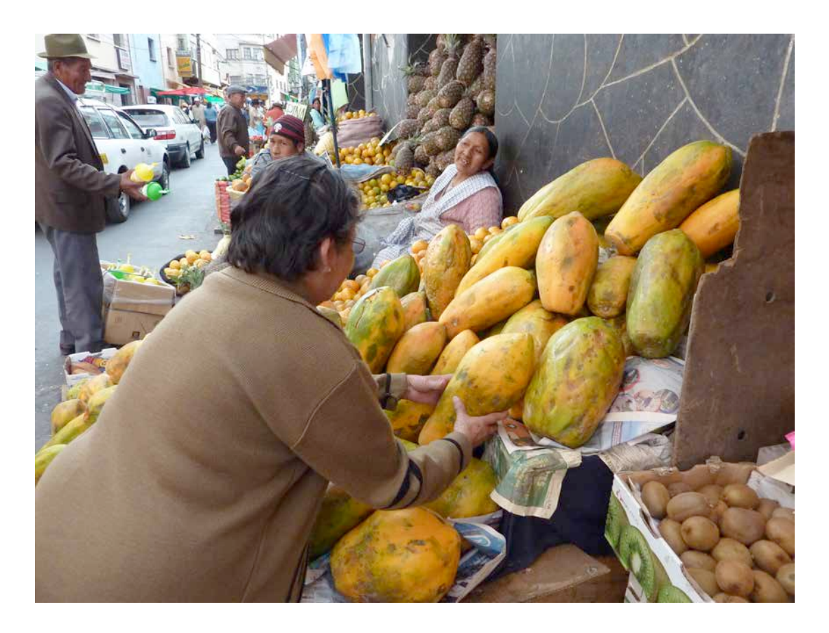
You can even visit the "Witches Markets" in La Paz.

There are many, many Sacred Sites to explore and our experienced guides will ensure that you visit the best of these including Sacsayhuaman, Machu Picchu, Pisac, Ollantaytambo, Lake Titicaca, the Aramu Muru gateway, the Floating Islands, Islands of the Sun and Moon, Tiahuanaco and Copacabana.